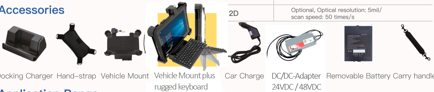
Docking Charger Hand-strap Vehicle Mount Vehicle Mount plus rugged keyboard Car Charge DC/DC-Adapter Removable Battery Carry handle